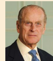
HRH The Prince Philip Duke of Edinburgh, KG KT OM GBE AC QSO